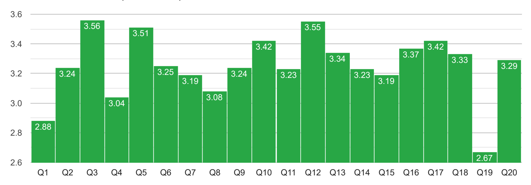
Question-wise Scores (in 0 to 4 scale)