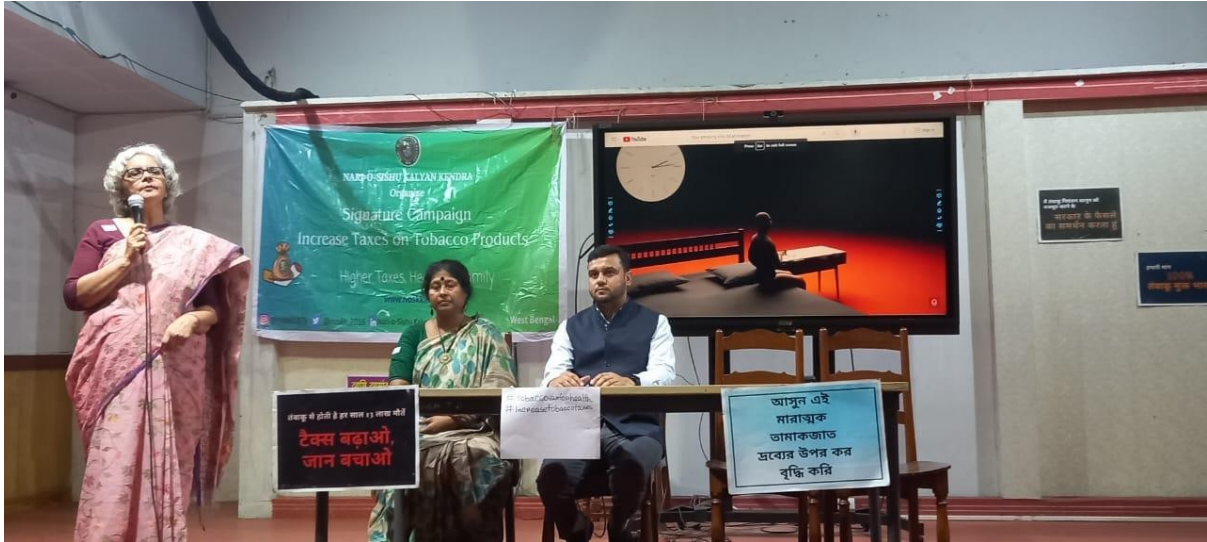
Photo4:Resource personwithWSC Convenor