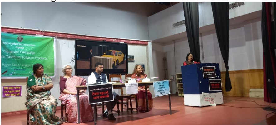
Photo3: ResourcepersonwithIQACCoordinatorandIn-Charge,NSS Unit,BKGC